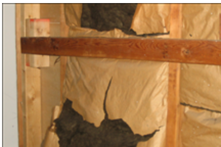
Interior walls of attic