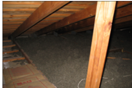
Highest level in attic