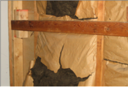
Interior walls of attic